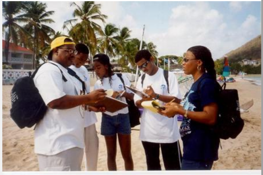
Recording observations on the beach