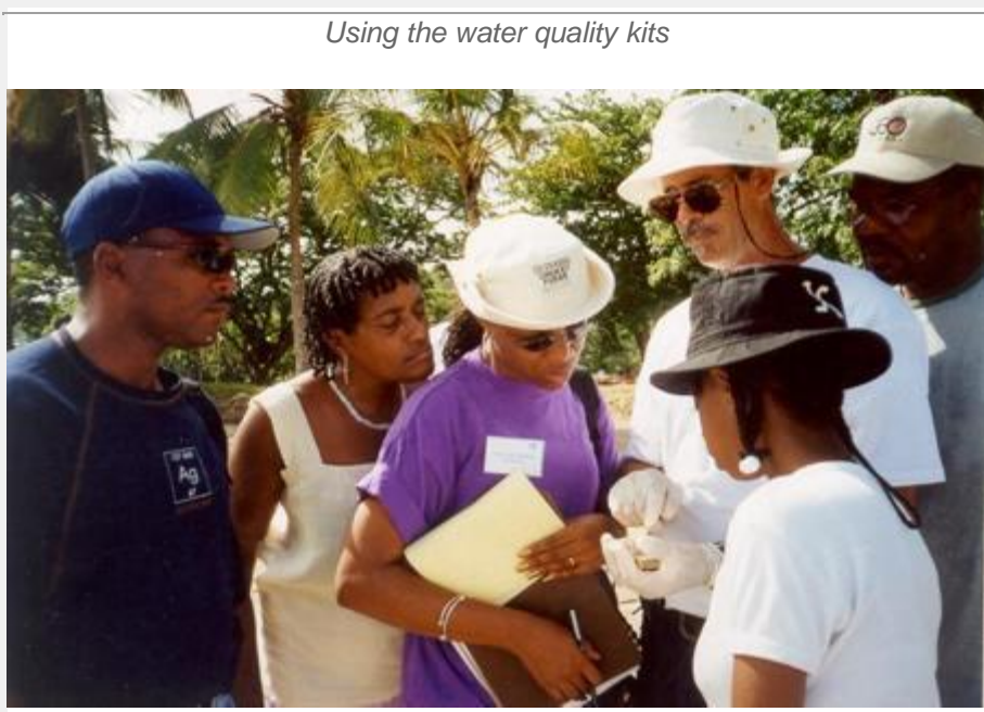
Reading the compass