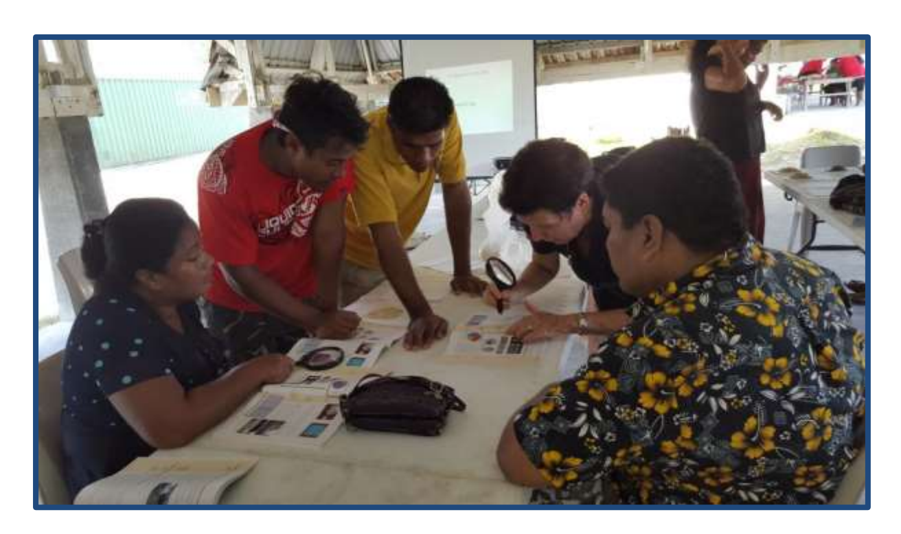
Measuring sand size, sorting and shape