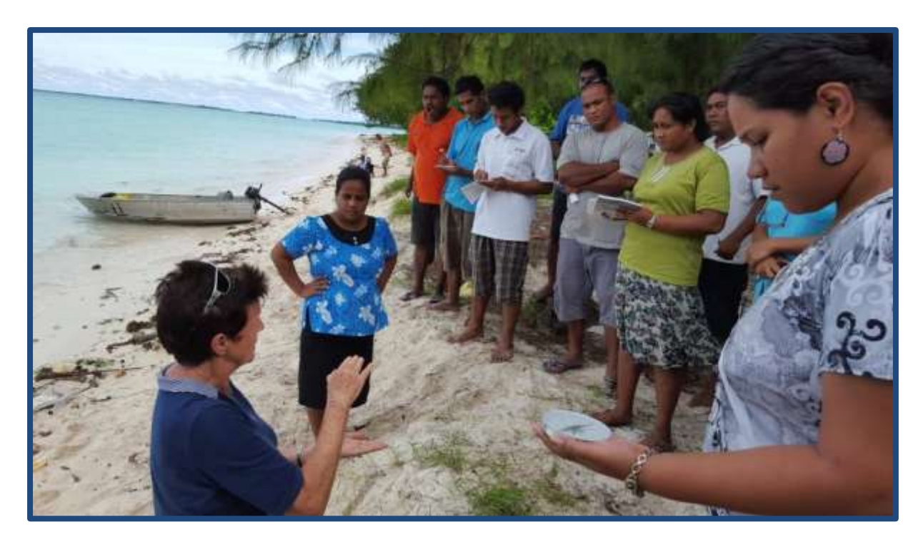
Measuring wave direction with a compass