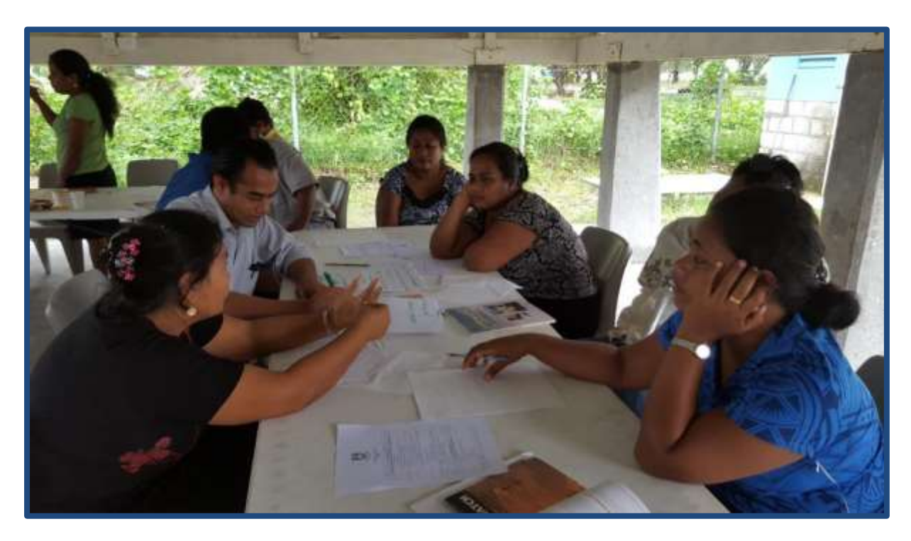
Small group discussions session