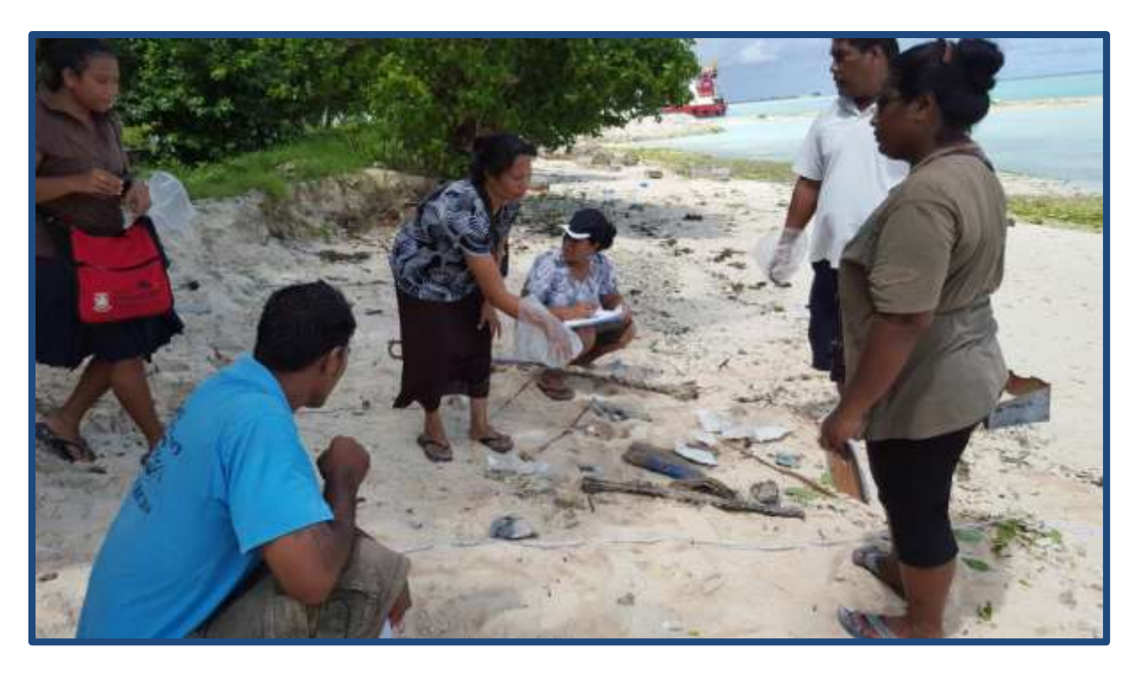
Collecting the debris and recording the different categories of debris