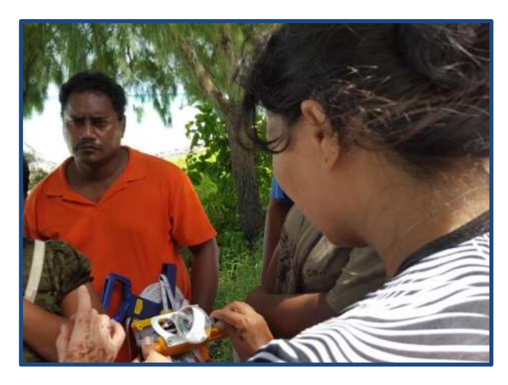
Reading the Abney level for beach profile measurements