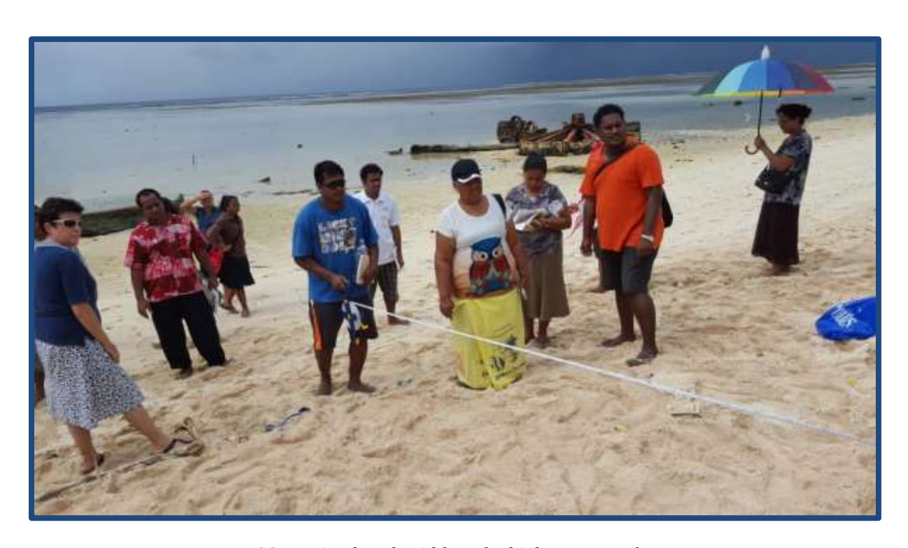
Measuring beach width to the high water mark