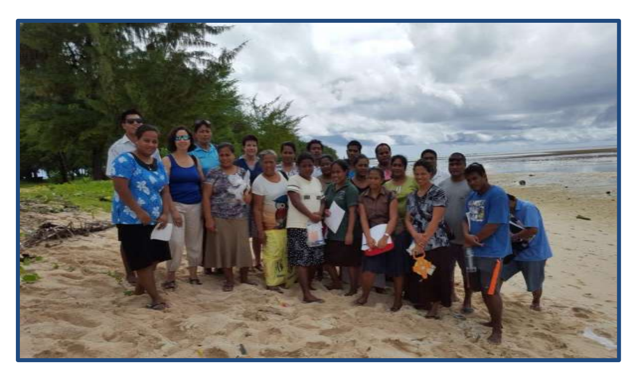
Workshop participants on the beach at Betio