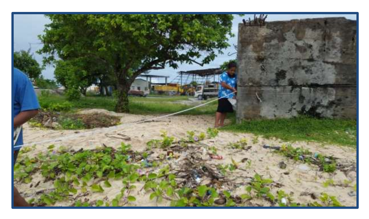
Measuring beach width from a reference point