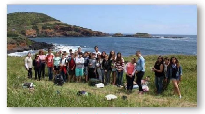
Sandwatchers of The Azores!

Through weekly staff meetings the Sandwatch project is now shared and discussed widely within the school. "The Sandwatch Manual is very handy and helpful in designing educational activities at the Baía das Mós, a very rich spot both in natural and historical terms." - In 2015 the Sandwatch project was introduced as a project in the school to help the