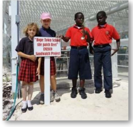
The Hope Town Reef Doctors

The tourists observed that there were very few fish species present. The students checked the reef themselves and concluded the fish were probably seeking shelter in deeper waters until the waters calm down.