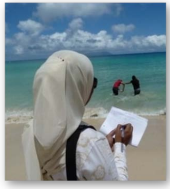
The Seychelles Regional Workshop