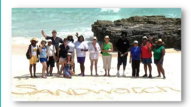
Regional Sandwatch Workshop, The Bahamas