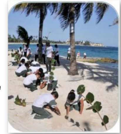
San Andres students planted several species of trees around the island's beaches

-90 students from CAJASAI School, Central Baptist School, Liceo del Caribe and Natania School with the assistance of the Colombian Army, Colombian Air Force and the Colombian Civil Defence, planted more than 400 trees over a 2-day period, 20-22 November 2009. Passers-by and local authorities followed their lead and joined the group in the planting. -The reforestation effort was called "More trees, less heat" and was organized by CORALINA with the support of the Office of the Governor, the San Andrés Police Department, the Consultative Commission and Giro Compàs.