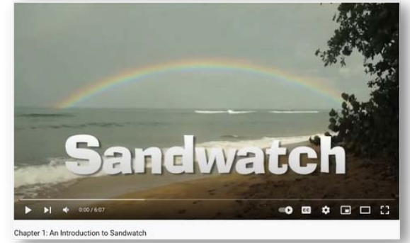
Check out the English and Spanish training videos on the Sandwatch website

In addition the Sandwatch Manual: Adapting to Climate Change and Educating for Sustainable Development are available in four (4) languages, English, French, Spanish and Portuguese on our website.