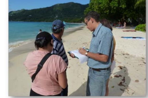
Taking beach measurements in Seychelles