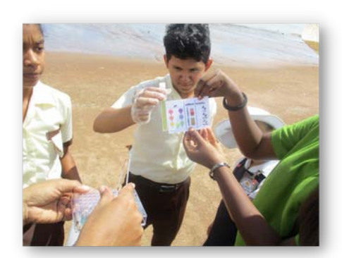
Testing water quality in Guyana