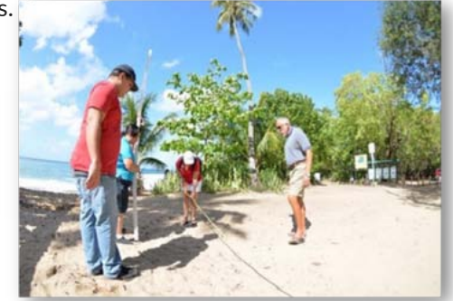
Measuring beach width in Puerto Rico