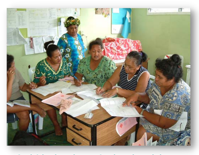
Cook Island teachers at Sandwatch workshop

The Sandwatcher, June 2006. Original article submitted by Gail Townsend.