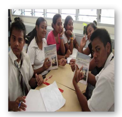
Cook Islands Sandwatchers