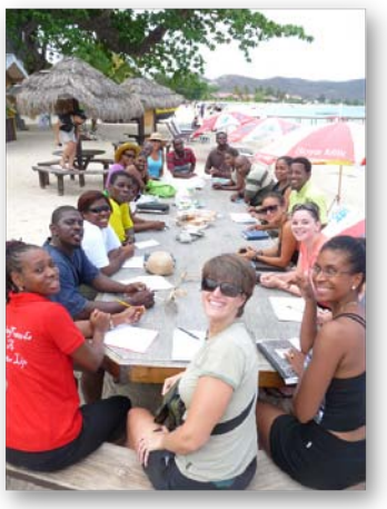
Sandwatch Teachers of Grenada